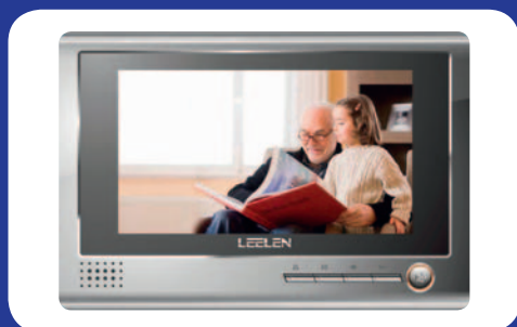
VDP-A25ABS 244 x 157 x 26 mm