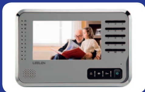
VDP-A22AL 266 x 175 x 25 mm