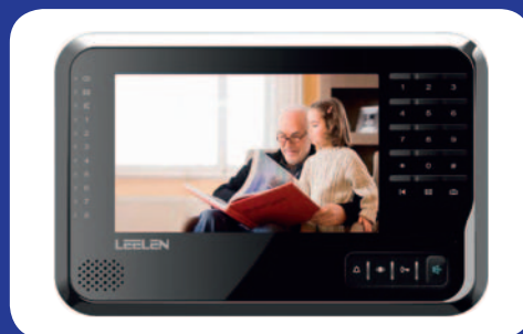
VDP-A22ABS 266 x 175 x 25 mm