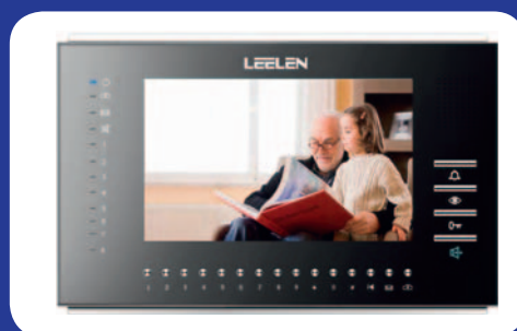
VDP-A23ABS 266 x 175 x 25 mm