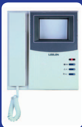
205 x 228x 65 mm