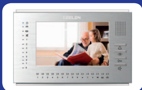
VDP-A23AL 266 x 175 x 25 mm